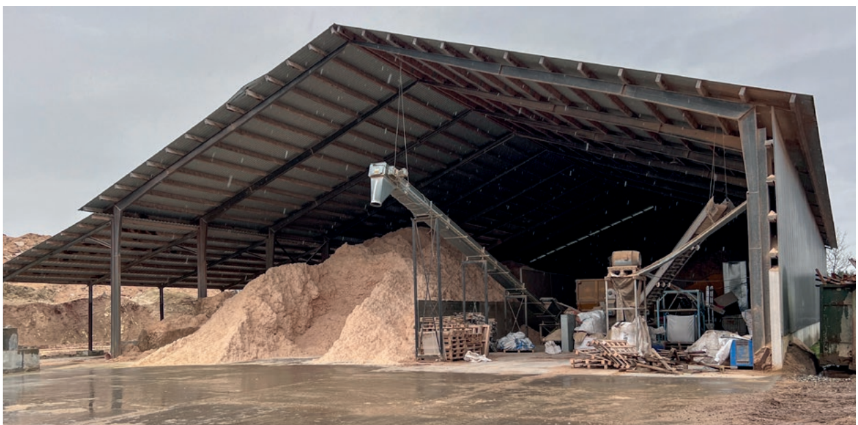
The Sønderup Montage facility.